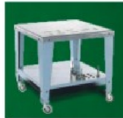
Table: 800 x 800 x 850 (LWH) provided with reaching castors.

Magnetic Base: 200 x 125 x 125 (LWH) For quickest mounting of 'Tap Easy' on larger work