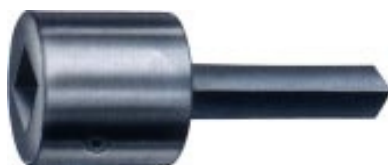
TAPER SHANK - FEMALE SQUARE