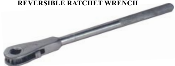
REVERSIBLE RATCHET WRENCH